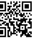
Email List Sign Up

Acolytes/Bible Bearers; Scripture Readers; Greeters/Ushers: Sign up online www.trmethodist.net/online-sign-ups