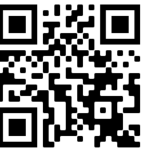
Email List Sign Up

Whether you are worshipping with us in person, online, or in your cars on 88.9FM, we are grateful you have joined us! Let us know you're worshipping with us & stay connected during the week