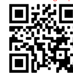
Email List Sign Up

Whether you are worshipping with us in person, online, or in your cars on 88.9FM, we are grateful you have joined us! Let us know you're worshipping with us & stay connected during the week