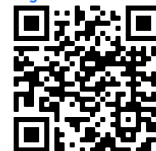
Digital Connect Card

Whether you are worshipping with us in person, online, or in your cars on 88.9FM, we are grateful you have joined us! Let us know you're worshipping with us & stay connected during the week